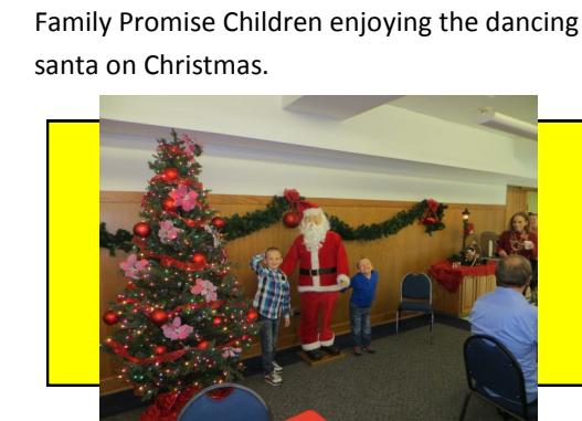
Family Promise Children enjoying the dancing santa on Christmas.